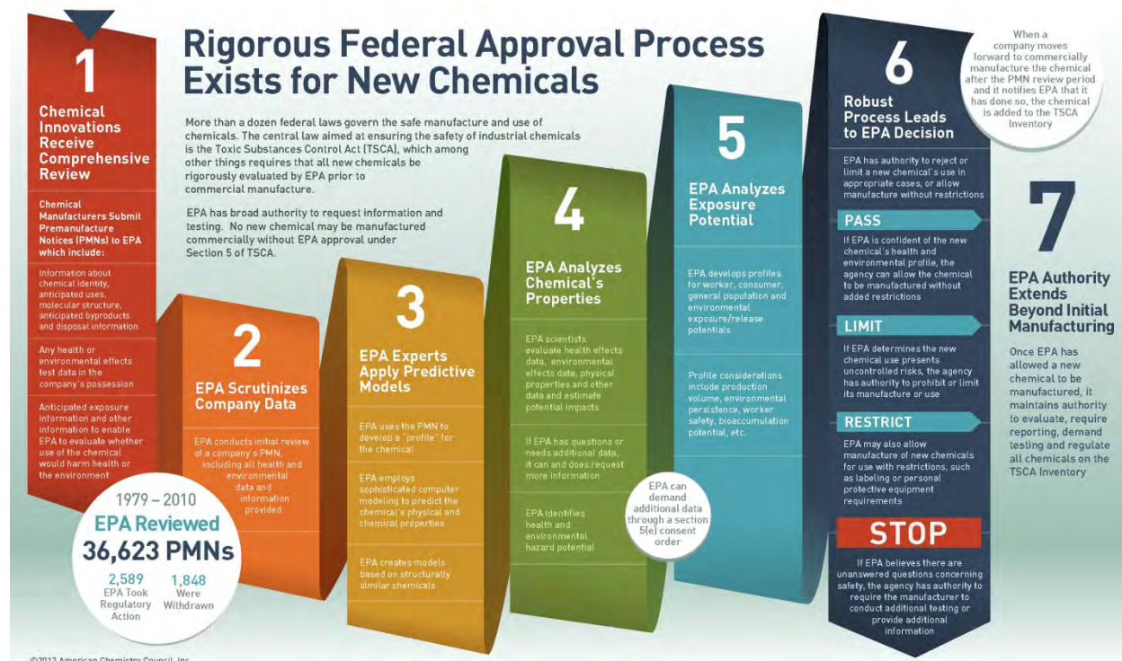
Figure 2 ACC illustrates the rigorous review process for new chemicals

Our flame retardants work as intended. They have also undergone rigorous testing and meet the standards set by government scientists and regulators, as well as those set forth by our customers. The U.S. EPA requires extensive scientific review before it authorizes the production of flame retardants, which are among the most carefully studied chemicals used in consumer products. Our Firemaster® 550 flame retardant led our industry in an innovative move to greener chemicals.