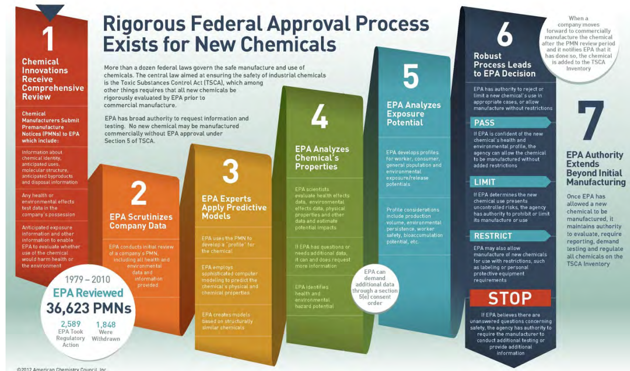
Figure 2 ACC illustrates the rigorous review process for new chemicals

Our flame retardants work as intended. They have also undergone rigorous testing and meet the standards set by government scientists and regulators, as well as those set forth by our customers. The U.S. EPA requires extensive scientific review before it authorizes the production of flame retardants, which are among the most carefully studied chemicals used in consumer products. Our Firemaster® 550 flame retardant led our industry in an innovative move to greener chemicals.